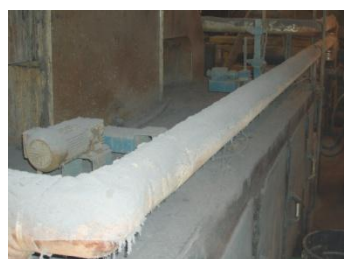
Fugitive Dust Accumulation