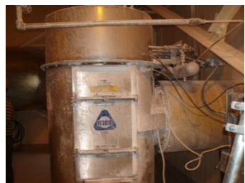
Dust Collector with Deflagration Vent to the Outside